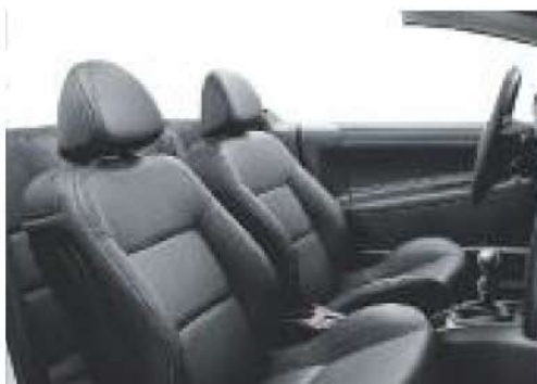
Integral Black leather interior*