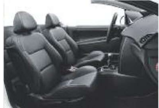
Luxury Black leather*