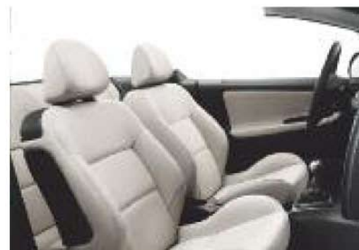
Integral Oran Grey leather*