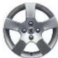
16" Canberra Alloy Wheel