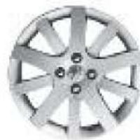
17" Hockenheim Alloy Wheel