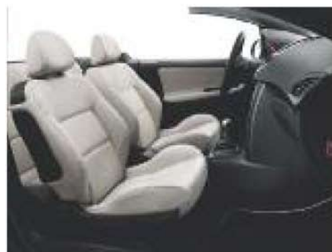
Luxury Oran Grey Leather*