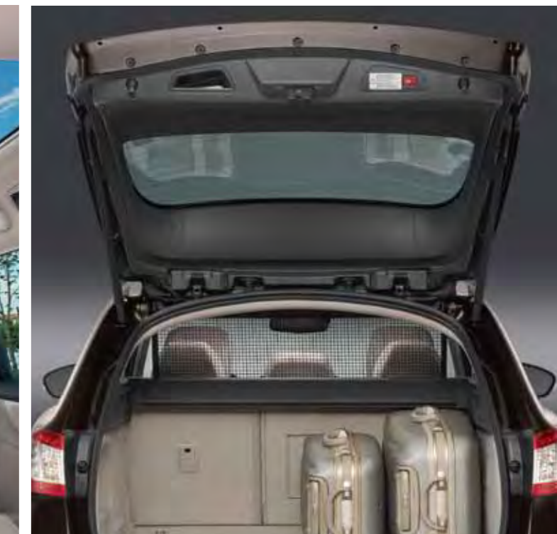
Motorised tailgate with vast boot space from 660 litres to 1,865 litres.