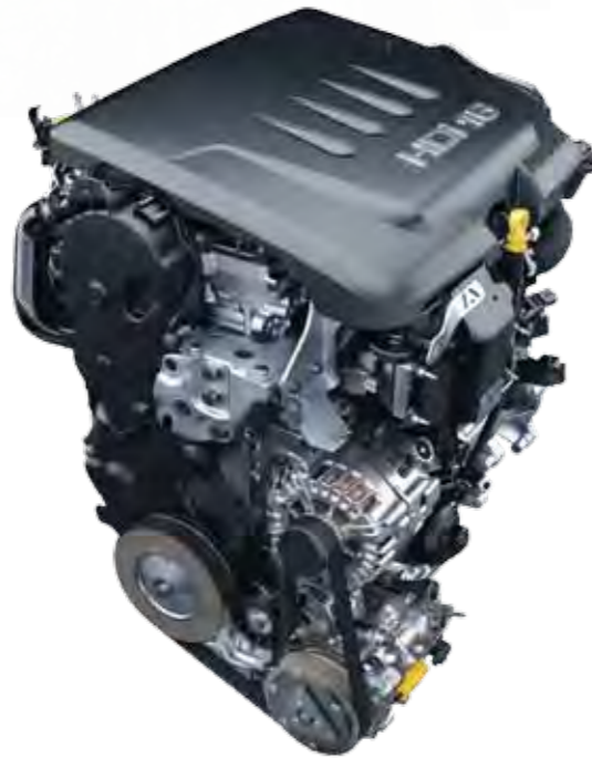
2.2L HDi FAP 204bhp 450Nm

The HDi technology is combined with an extremely high-performance emission control system, the Particle Emission Filter (FAP). A self-cleaning system, it treats the gas resulting from the combustion of diesel in the engine. The filter helps reduce the diesel particles, making the 2.2L HDi FAP a cleaner engine.