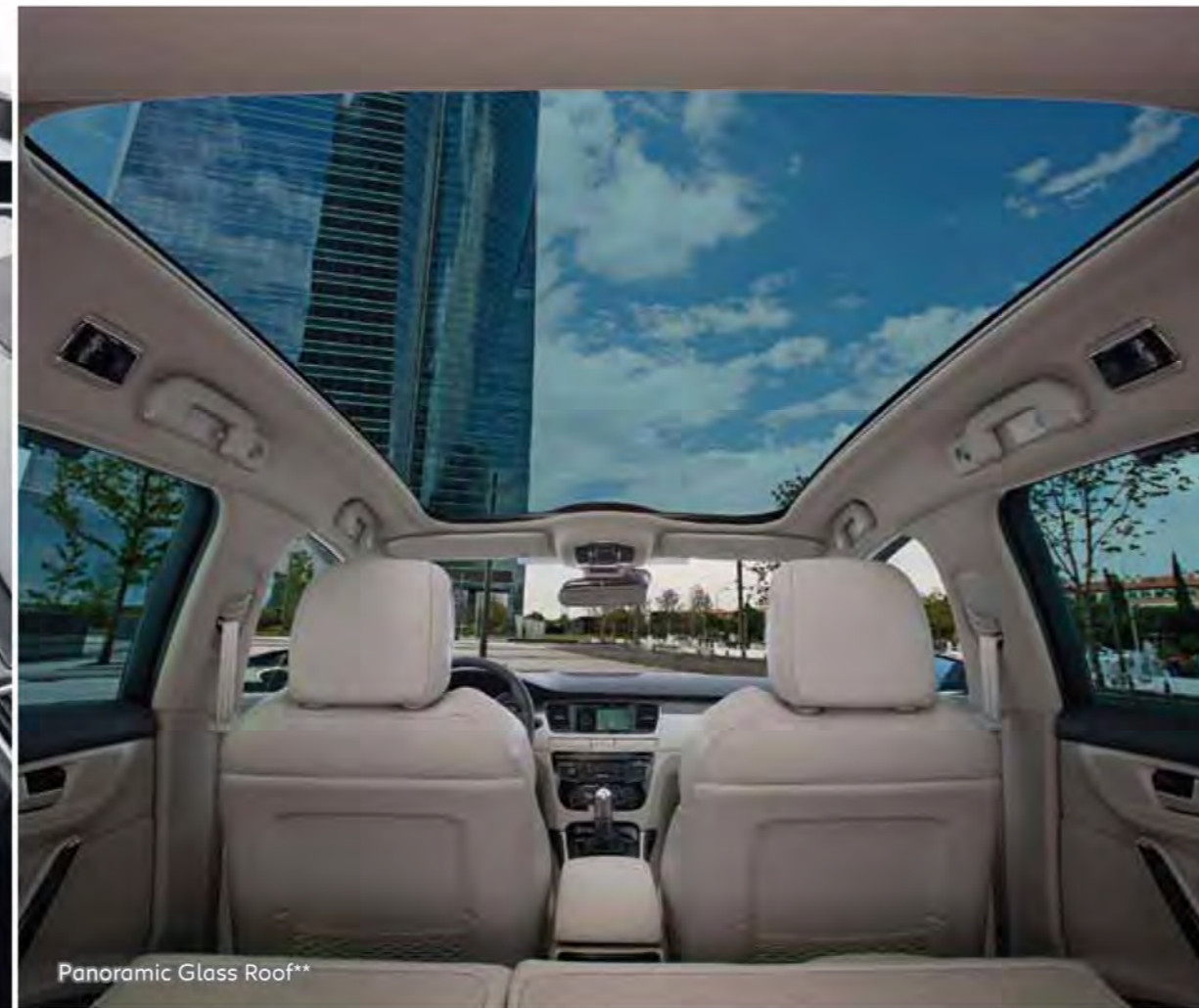
Panoramic Glass Roof**