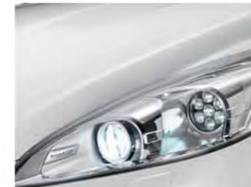
Dynamic bi-xenon headlamps with washers and auto height adjustment