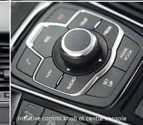
Intuitive control knob at centre console