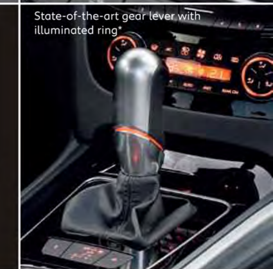
State-of-the-art gear lever with illuminated ring*