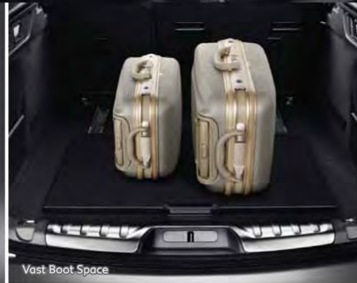
Vast Boot Space