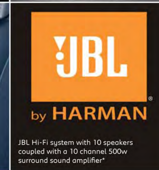
JBL Hi-Fi system with 10 speakers coupled with a 10 channel 500w surround sound amplifier*