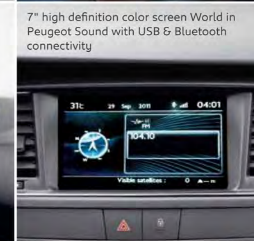
7" high definition color screen World in Peugeot Sound with USB & Bluetooth connectivity