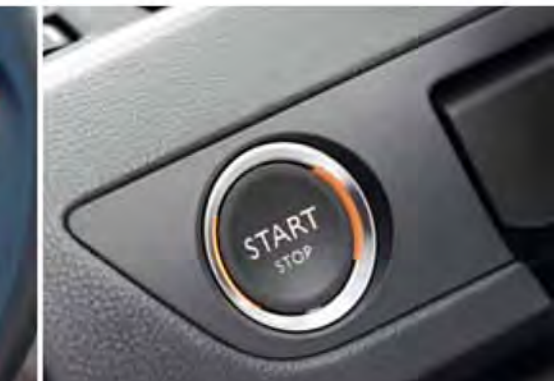
Intelligent keyless entry with push start button*