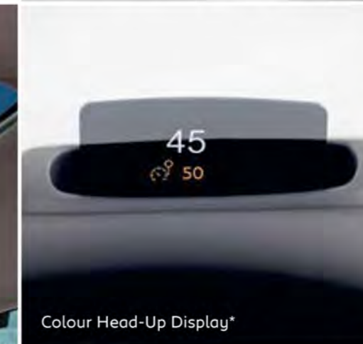
Colour Head-Up Display*