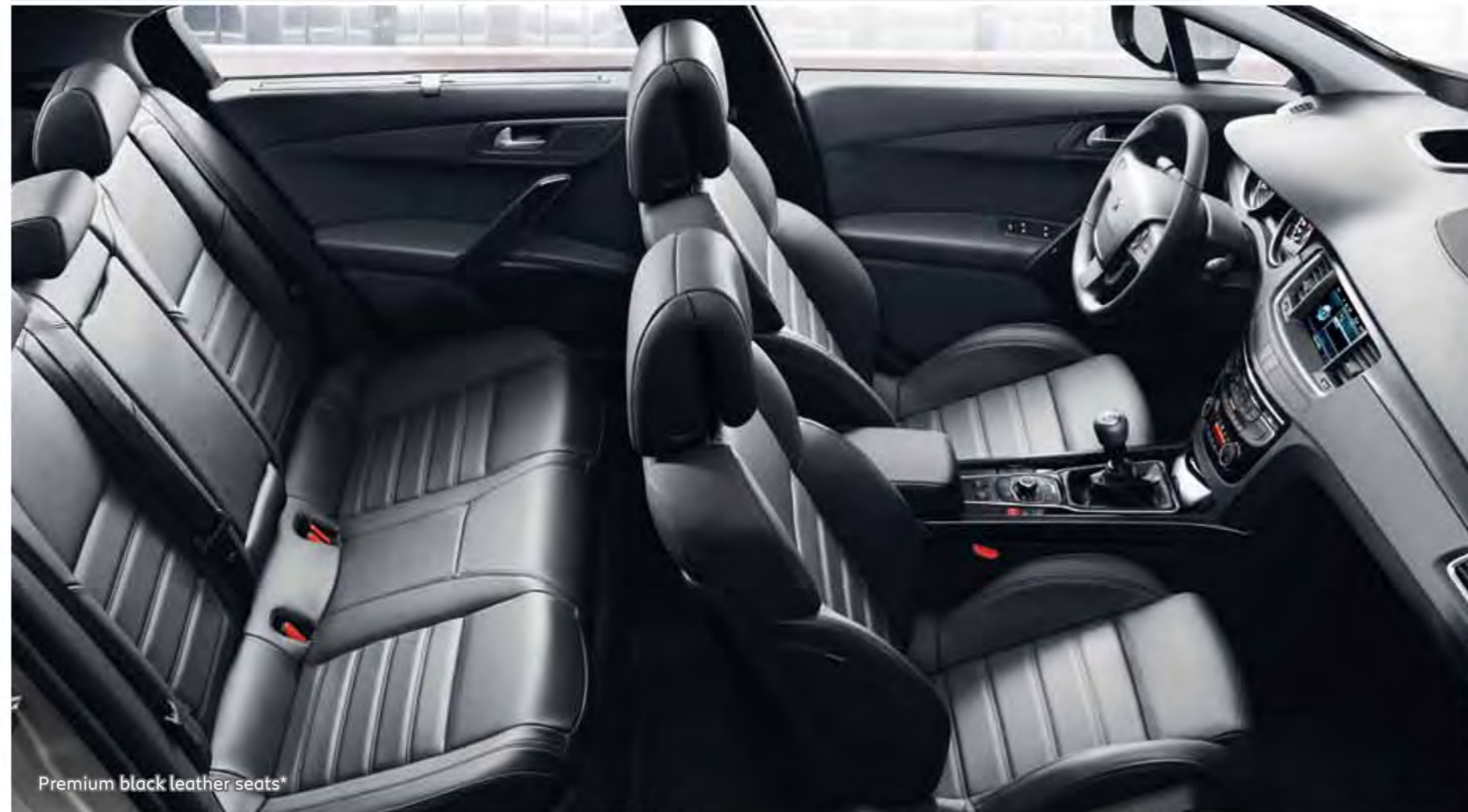
Premium black leather seats*