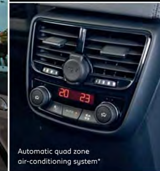
Automatic quad zone air-conditioning system*