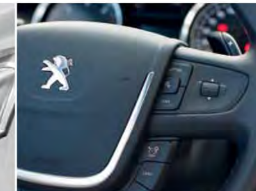
Steering wheel with audio, cruise control and paddle shifters