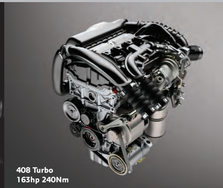
408 Turbo 163hp 240Nm