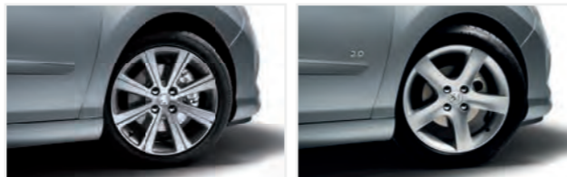
408 1.6 TURBO MELBOURNE 408 2.0L RINJANI