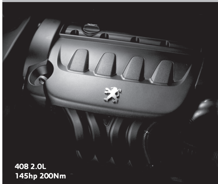
408 2.0L 145hp 200Nm

The interior styling of the 408 is one of unbridled space and elegant sophistication. A combination of exceptional comfort and premium European styling creates the desire to extend the moment, the time of a journey, for as long as possible. Drive it to experience it.