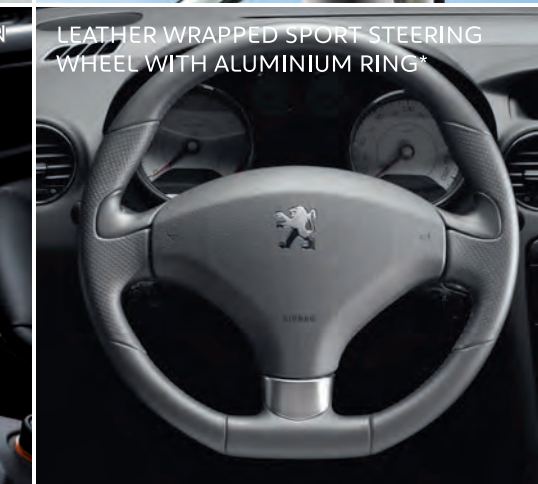
LEATHER WRAPPED SPORT STEERING WHEEL WITH ALUMINIUM RING*