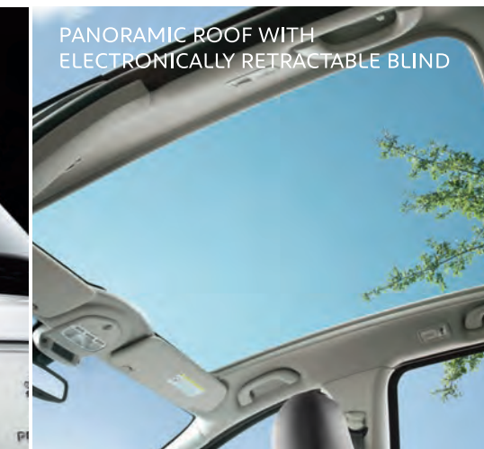
PANORAMIC ROOF WITH ELECTRONICALLY RETRACTABLE BLIND