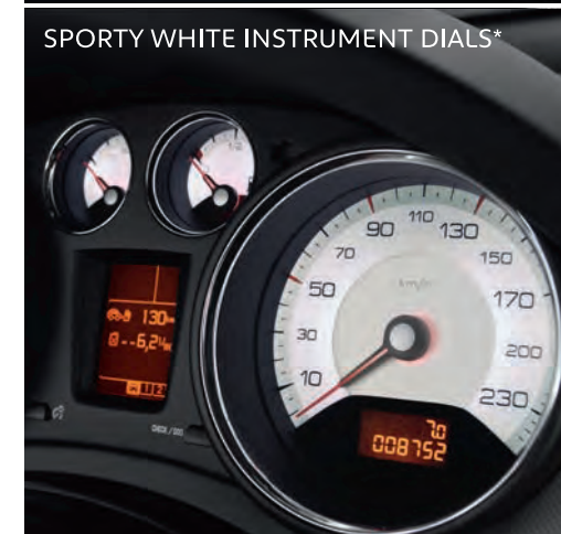
SPORTY WHITE INSTRUMENT DIALS*