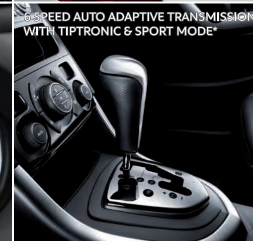
6 SPEED AUTO ADAPTIVE TRANSMISSION WITH TIPTRONIC & SPORT MODE*