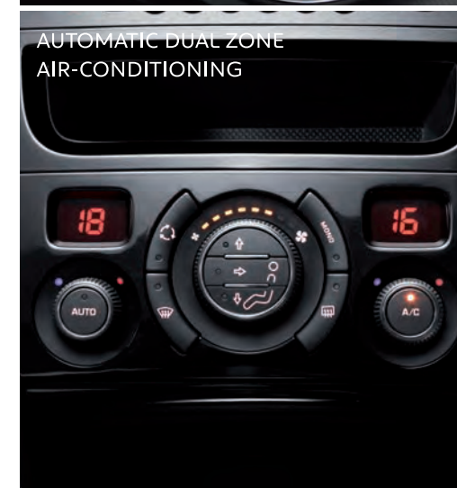
AUTOMATIC DUAL ZONE AIR-CONDITIONING