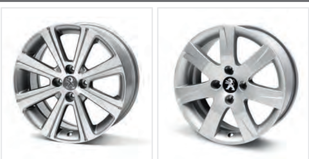
17" MELBOURNE (308 Turbo)