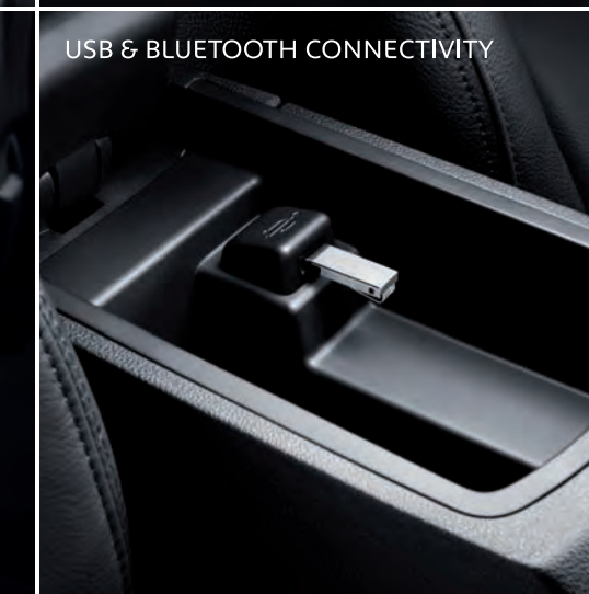
USB & BLUETOOTH CONNECTIVITY