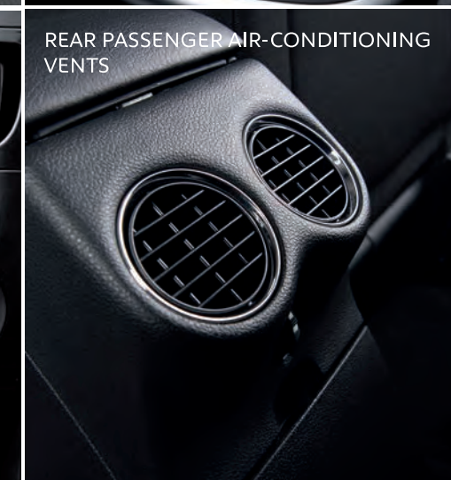
REAR PASSENGER AIR-CONDITIONING VENTS