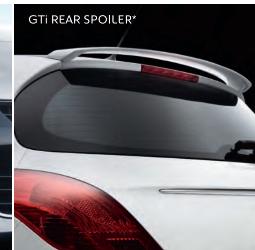
GTI REAR SPOILER*