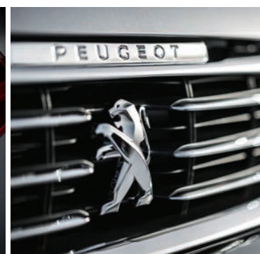
NEXT GENERATION SIGNATURE FACADE