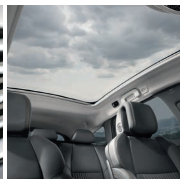
PANORAMIC ROOF WITH ELECTRIC BLIND*