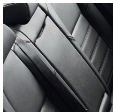
NAPPA LEATHER UPHOLSTERY**

Reserved but outstanding contours, an imposing facade, and a presence that is both subtle and powerful - as it is with a genuine sense of substance, true style never shouts, and the stunning new Peugeot 508 is a fine example of this.