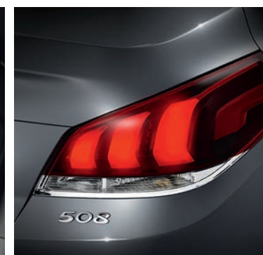
NEW SIGNATURE LIGHTING