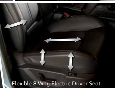
Flexible 8 Way Electric Driver Seat