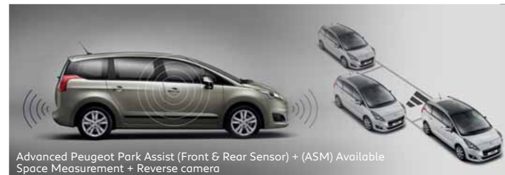
Advanced Peugeot Park Assist (Front & Rear Sensor) + (ASM) Available Space Measurement + Reverse camera