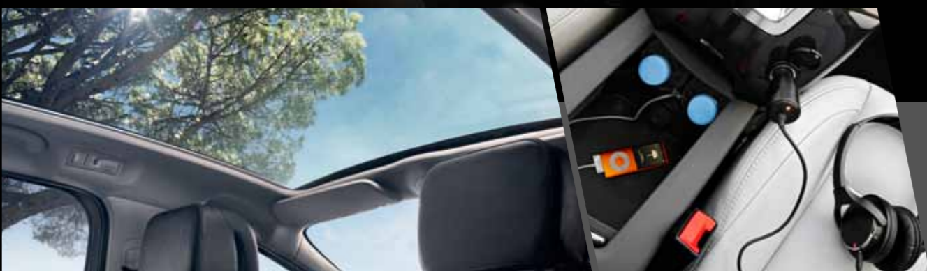
Panoramic Roof with Electronic Retractable Blind

INTEGRATED MULTIMEDIA SYSTEM - Dual 7-inch LCD Screens incorporating World In Peugeot Sound 6 speaker system with MP3 / CD /USB / Bluetooth