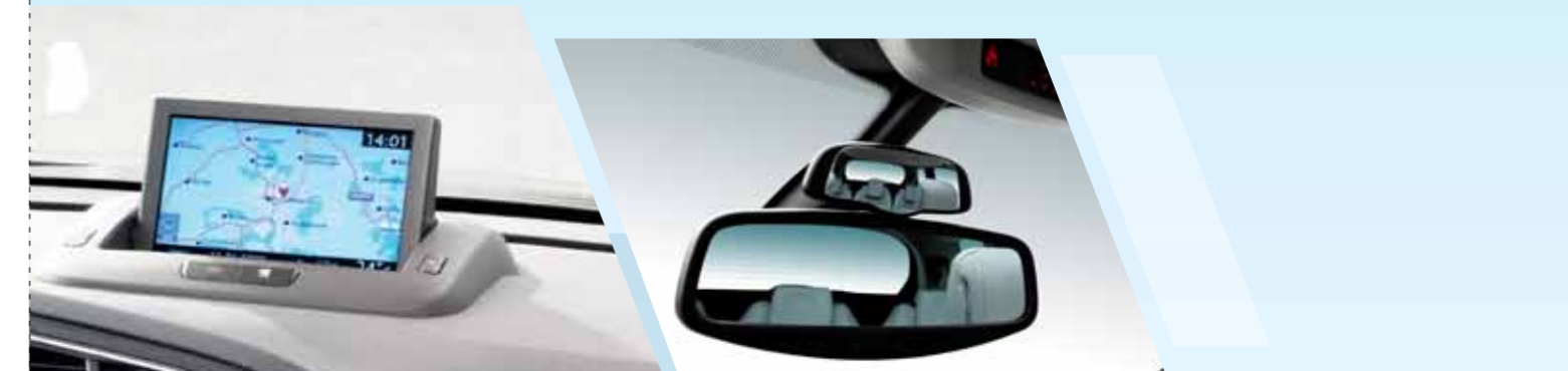
Intuitive High Resolution 7" Retractable Colour Screen with Navigation