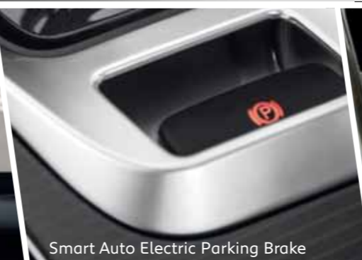
Smart Auto Electric Parking Brake