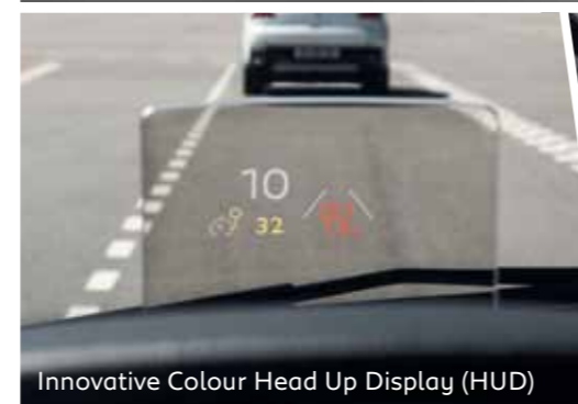
Innovative Colour Head Up Display (HUD)