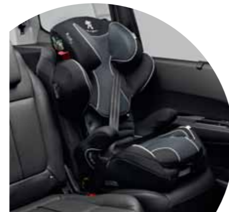
2 ISOFIX location points