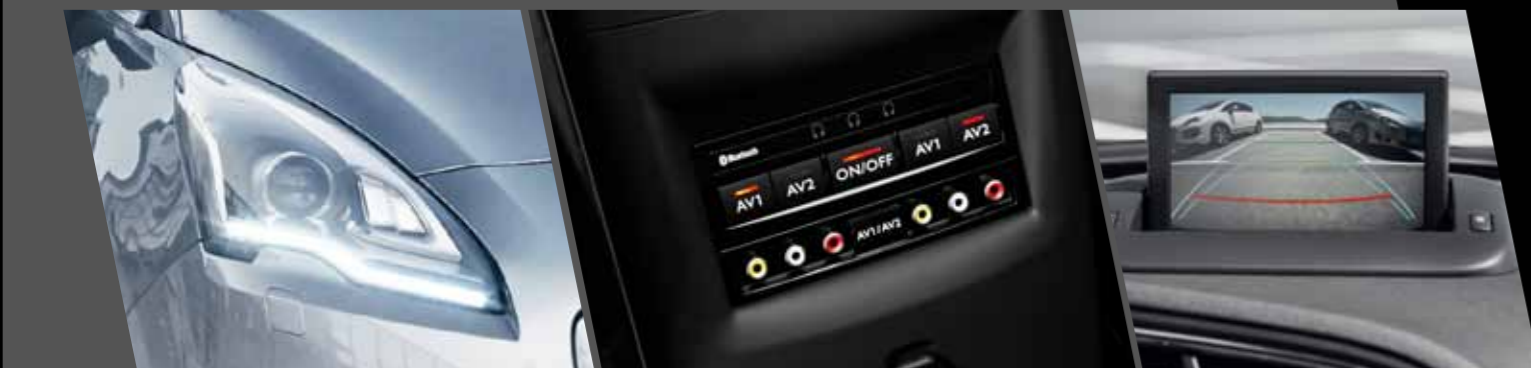
Dynamic Bi-Xenon Advanced Lighting System