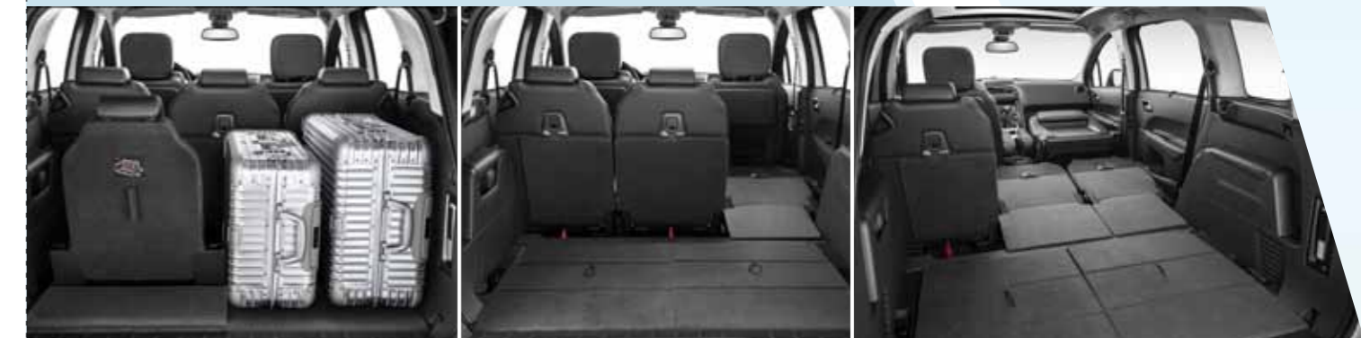
FLEXIBLE MODULARITY - Flat Fold 2nd And 3rd Row Seats up to 2,506 litres