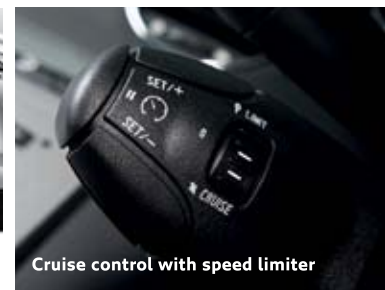
Cruise control with speed limiter