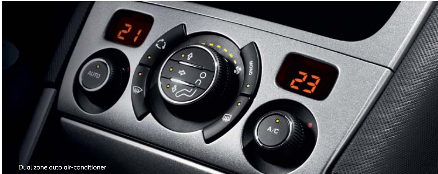
Dual zone auto air-conditioner