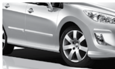
Body coloured side mouldings