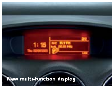
New multi-function display