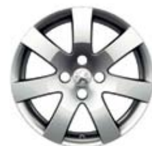
New 16 inch "Santiaguito" alloy rims