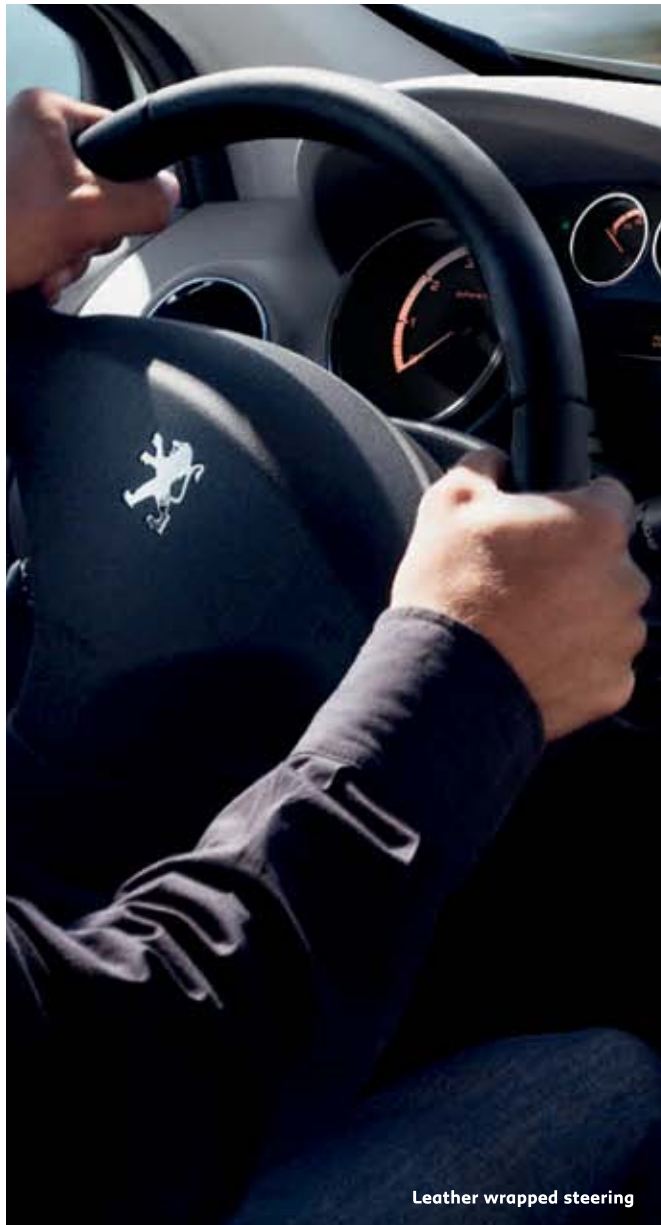
Leather wrapped steering