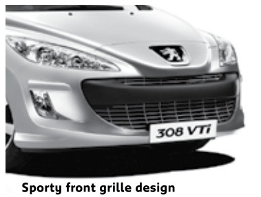
Sporty front grille design