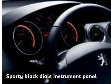
Sporty black dials instrument panel