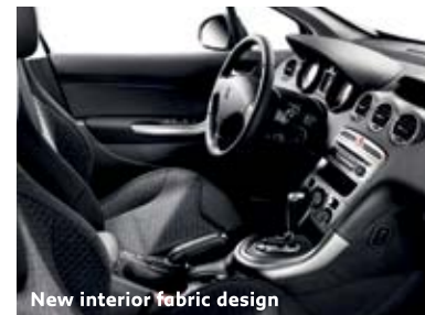
New interior fabric design