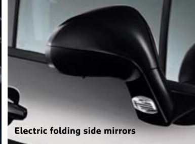
Electric folding side mirrors