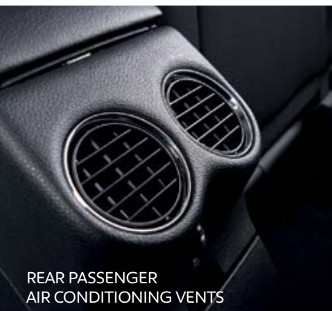
REAR PASSENGER AIR CONDITIONING VENTS

The new Peugeot 308 Turbo now comes with a new 6 speed adaptive auto transmission that delivers generous torque and power while contributing to higher fuel efficiency. The new race inspired rear diffuser completes the package. Entertainment on the go now comes standard with USB and Bluetooth connectivity. Comfort is guaranteed with Automatic Dual Zone Air conditioning for both front and rear passengers. Unparalleled levels of safety are assured with a 6 airbag system, cruise control with a speed limiter function and an Electronic Stability Program for a secure drive.