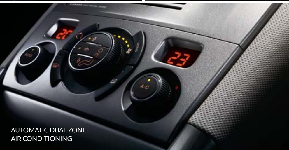
AUTOMATIC DUAL ZONE AIR CONDITIONING