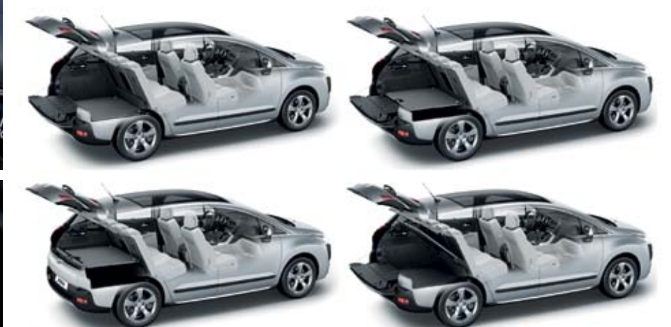
MULTI-FLEX INTERIOR (VERSATILE 3 LEVEL BOOT, SPLIT TAILGATE, FOLDABLE REAR SEATS)