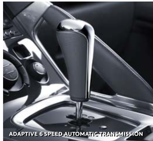
ADAPTIVE 6 SPEED AUTOMATIC TRANSMISSION