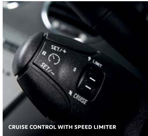
CRUISE CONTROL WITH SPEED LIMITER