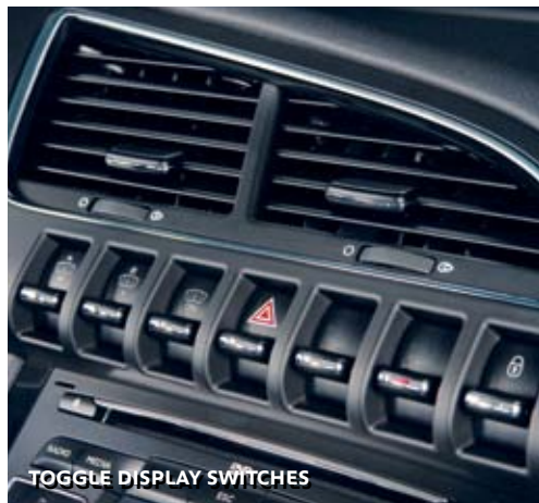
TOGGLE DISPLAY SWITCHES