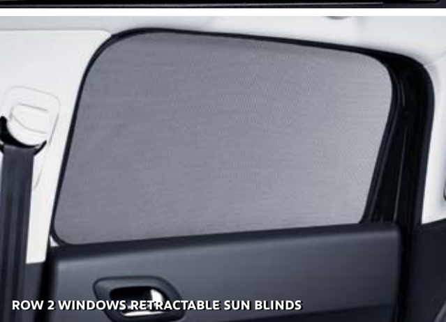
ROW 2 WINDOWS RETRACTABLE SUN BLINDS

The 3008 harnesses the power of innovation. It pushes the boundaries of engineering, design, style and safety. The 3008 is adaptable, nimble and robust. This is where inspired performance meets refined versatility.