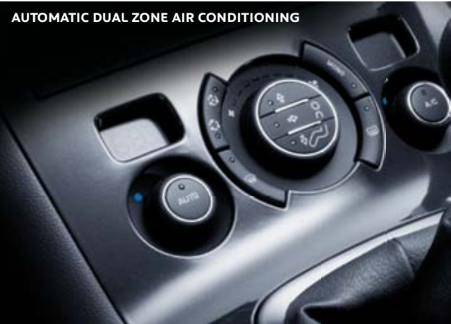
AUTOMATIC DUAL ZONE AIR CONDITIONING