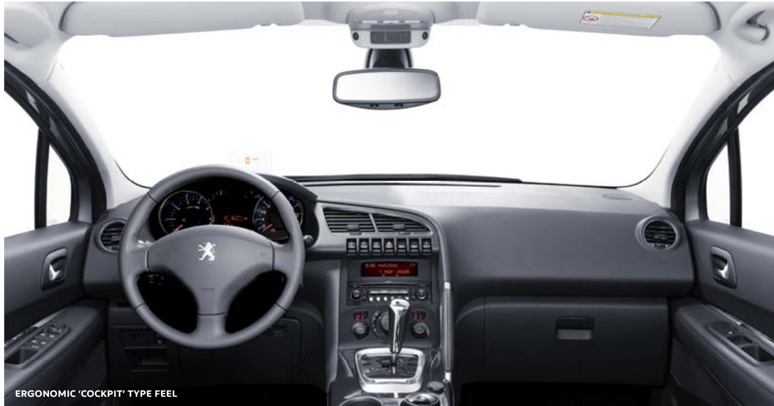
ERGONOMIC 'COCKPIT' TYPE FEEL