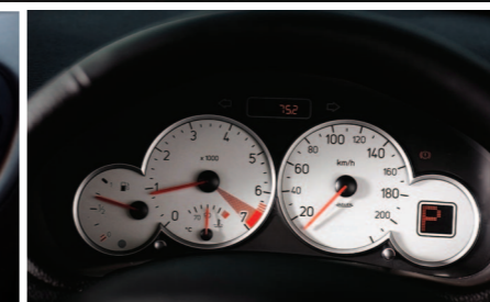
Sporty white dials 4 silver-trimmed dials with clear and easy-to-read information.