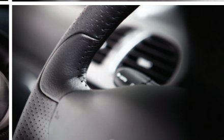
Leather-wrapped steering wheel 3-spoke steering wheel trimmed with perforated leather to add a touch of class and sportiness.