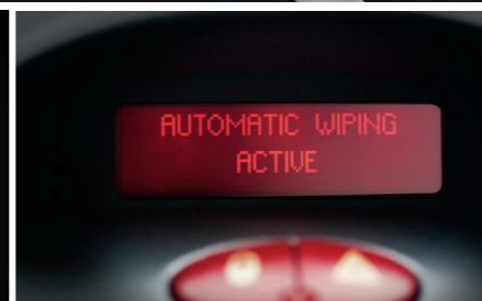
Multifunction display Located in the centre, it has all the information you need right in front of you to enhance your driving experience.