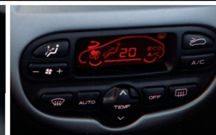
Automatic climate control air-con with pollen filter Reduces the concentration of airborne contaminants, providing cleaner air for passengers.