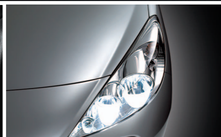
Sensor activated headlights Dipped beam headlights will be switched on automatically when the light sensors detect poor lighting.