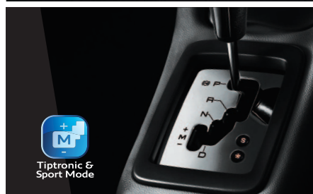
Transmission Adaptive Automatic Transmission with Tiptronic and Sport mode.