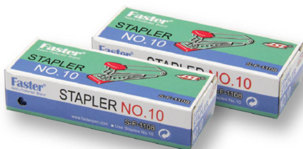
BOX OF 1 PC