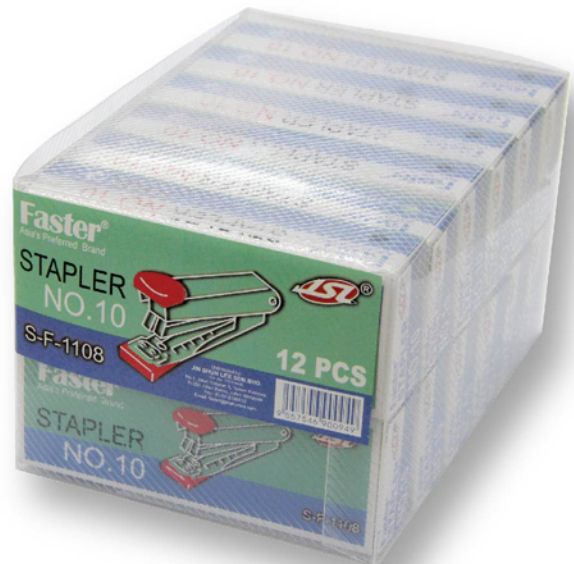
MED BOX OF 12 PCS