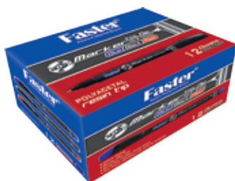
MED BOX OF 144 PCS