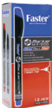
BOX OF 12 PCS