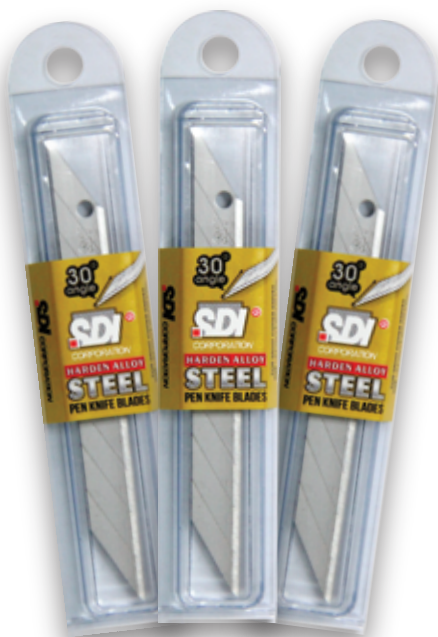
CASE OF 5 PCS