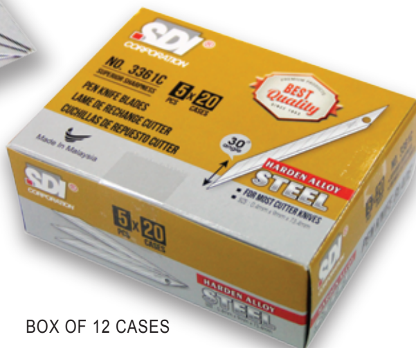
BOX OF 12 CASES